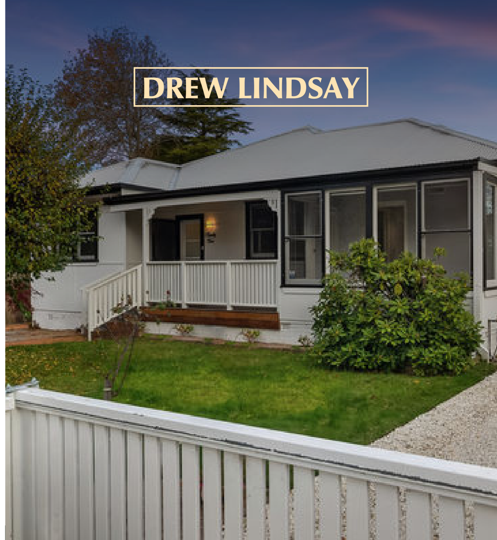
95 Sunset Point Drive, Mittagong